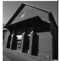
Blackfriars Playhouse Staunton, Virginia