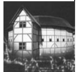
The Globe London, England