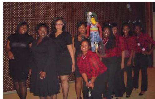
Spirit Night Winners 2009