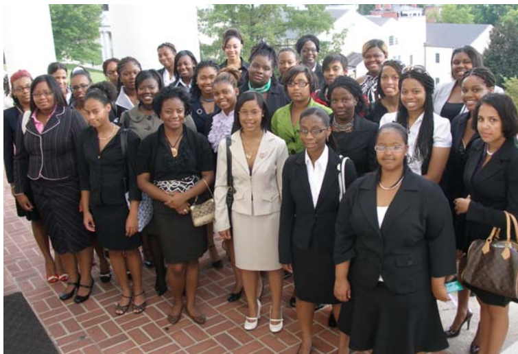
Ida B. Wells Living Learning Community members Dressed for Success at the Etiquette Reception with the Career Academy